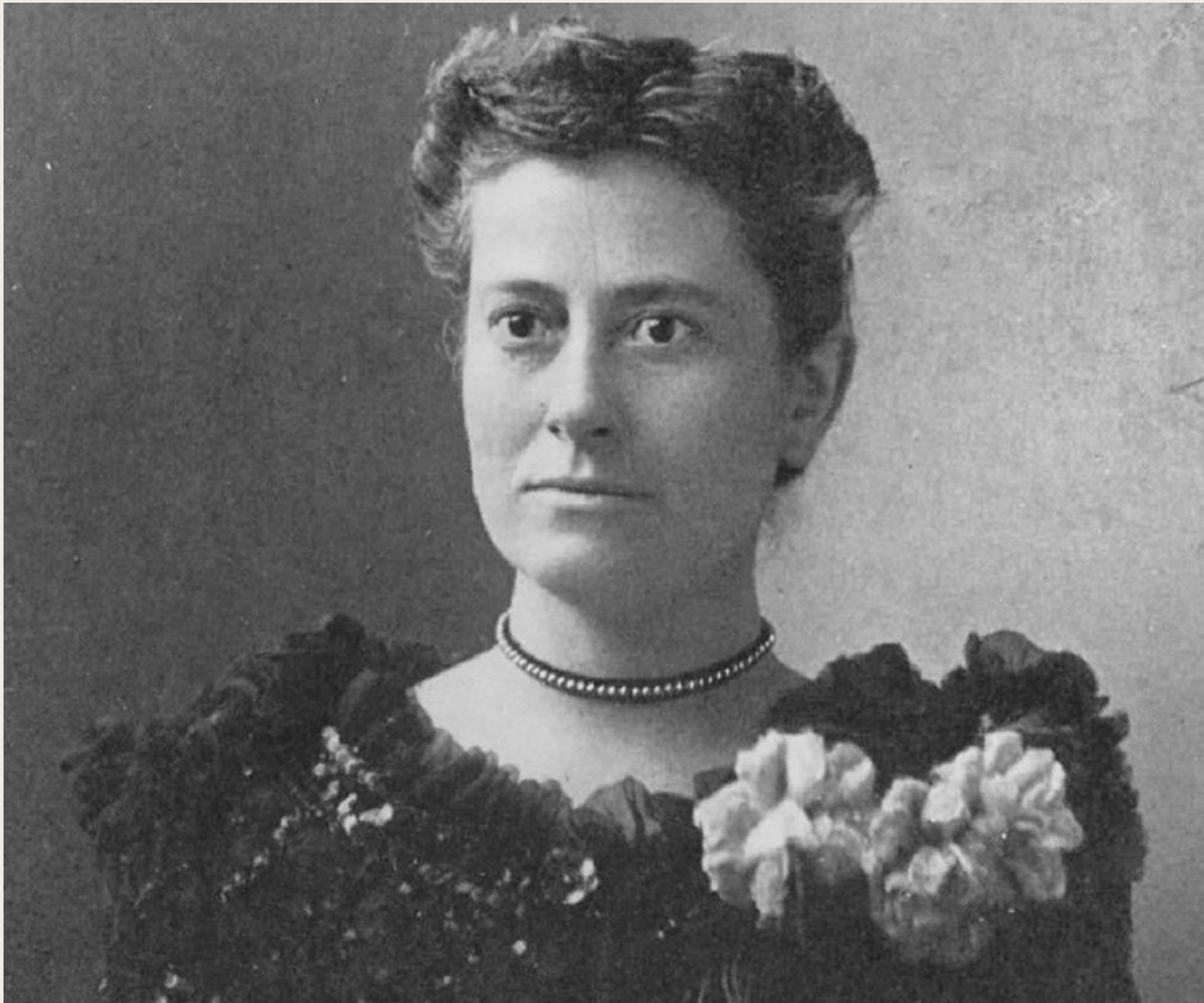
Henrietta Swan Leavitt