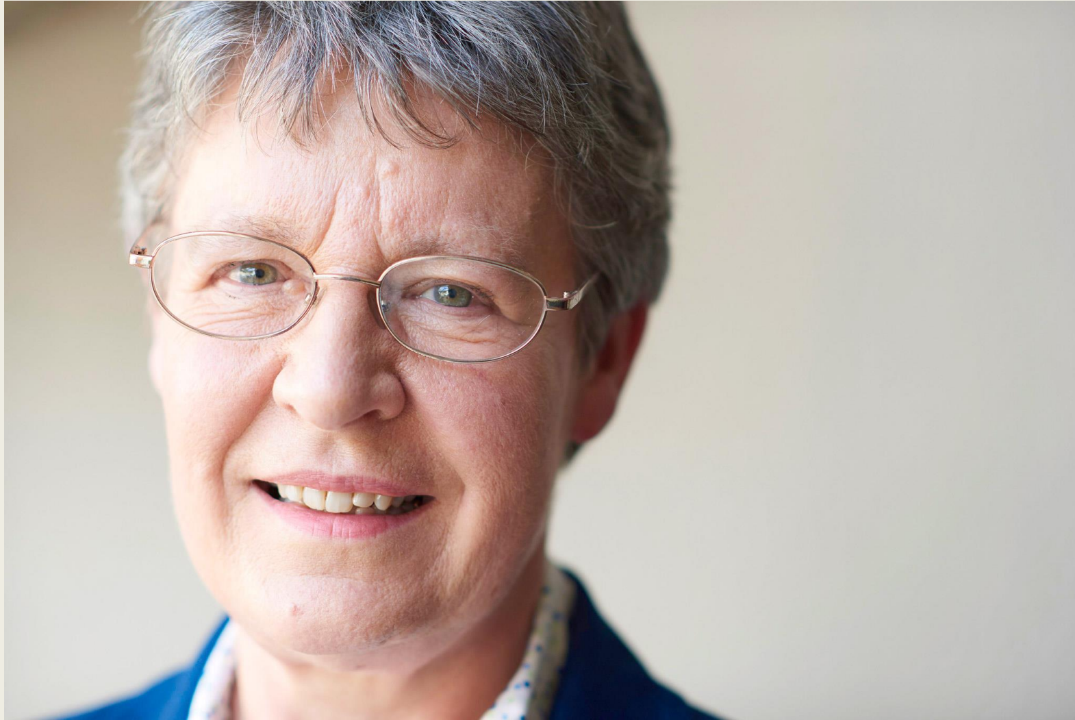
Jocelyn Bell Burnell